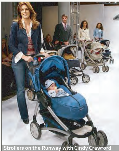
Strollers on the Runway with Cindy Crawford

storage basket, combined with high fashion design make this stroller the ultimate accessory and travel partner. ■