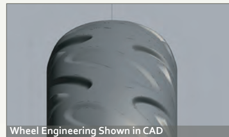
Wheel Engineering Shown in CAD

Innovative features, including one-handed steering, one-handed trigger activated fold, infinite one-handed seat recline, a removable snack tray, smooth running wheels, a pivoting canopy for protection from the sun and wind, and an oversized