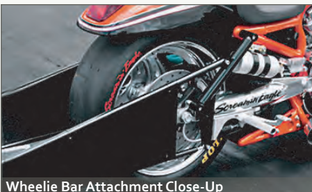
Wheelie Bar Attachment Close-Up

The VRXSE Screamin' Eagle® Destroyer™ is Harley Davidson's first out-of-the-box, drag racing motorcycle. Rider accommodations include a mini instrument panel, forward race position risers, a drag handlebar, handlebar controls designed for drag racing and an emergency shut-off tether. Rear-set foot pegs and a brake lever are positioned on the swing arm. The race seat features a high-rise back cushion. Based on the VRSC™ family and tuned by Custom Vehicle Operations, this bike can do a quarter mile run in less than ten seconds.