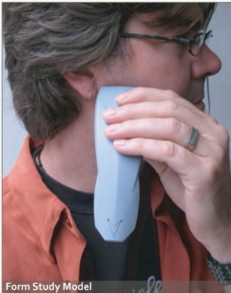
Form Study Model

In its first year of availability, sales more than doubled projections. Initially intended to sell only in the US, demand for this uniquely targeted product has created sales in Europe, South America and Australia. ■