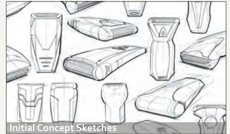
Initial Concept Sketches

Remington partnered with Brooks Stevens, Inc. to ensure this new product distinguished itself from the horde of adult shavers while reinforcing existing Remington brand language. Inspired by the game consoles, stealth aircraft and personal computer case mods that command many teenage boys'