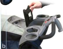
(b.) Console with cup holders and storage unit.