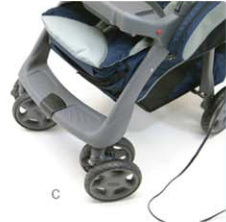
(c.) Styling of foot rest and wheels.