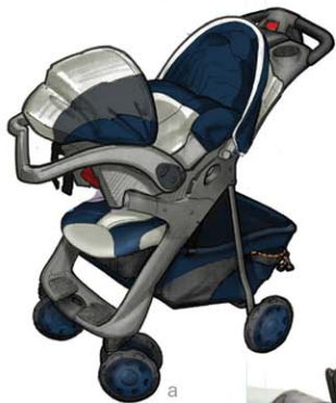
(a.) Integrated drop down visor

BSDA and Gerry Baby Products set a vigorous design program in motion that focused on developing a design solution with coherence, integrity, and conspicuous user value. At the core of this effort was the careful definition and implementation of consumer needs and desires, performance requirements, understanding of product use, competitive climate and effective retail presentation, as well as the application of sound design principles for cost effective tooling and manufacturing. (continued on next page)